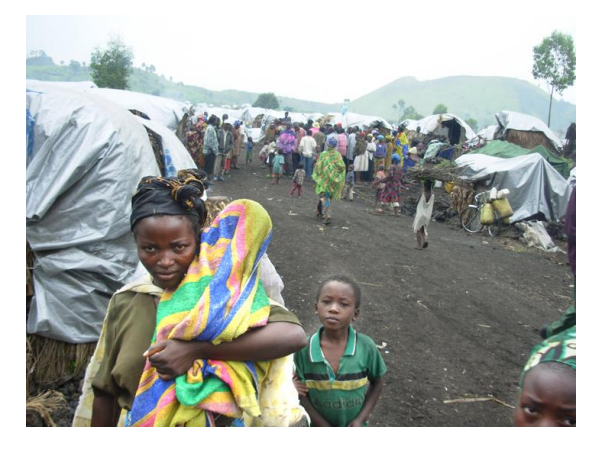
A displaced persons camp in DRC

Nearly six million people have died as a result of conflict and conflict related causes in the Congo since 1996. Forty-five thousand continue to die each month. Hundreds of thousands of women have been raped as weapon of war.